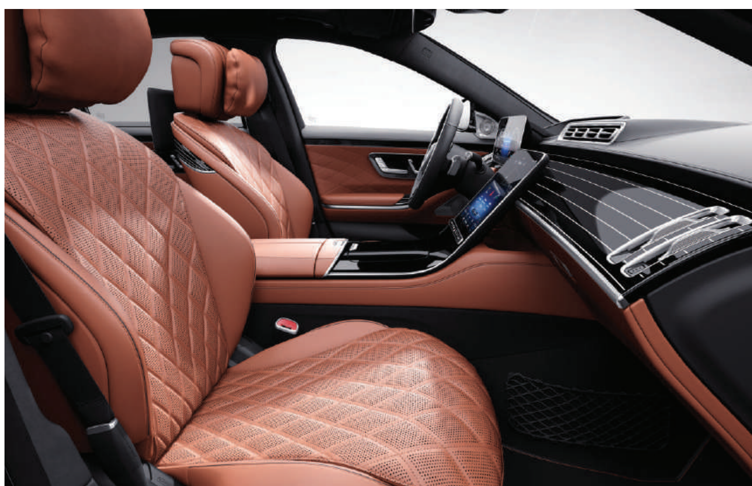
Nappa leather sienna brown