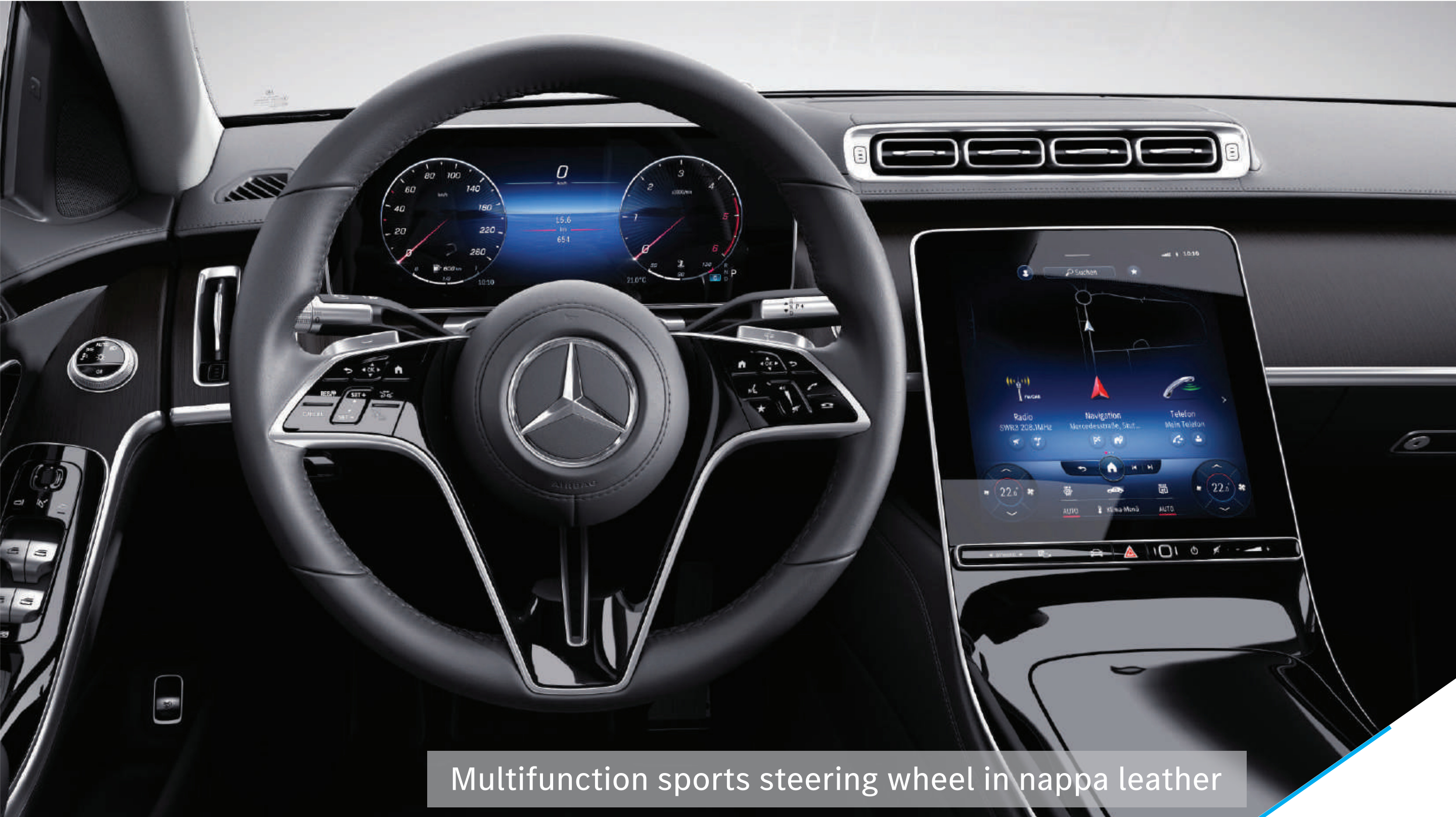
Multifunction sports steering wheel in nappa leather