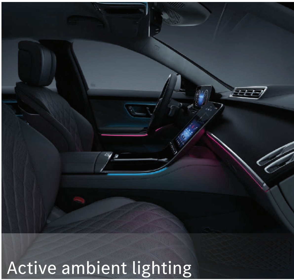
Active ambient lighting