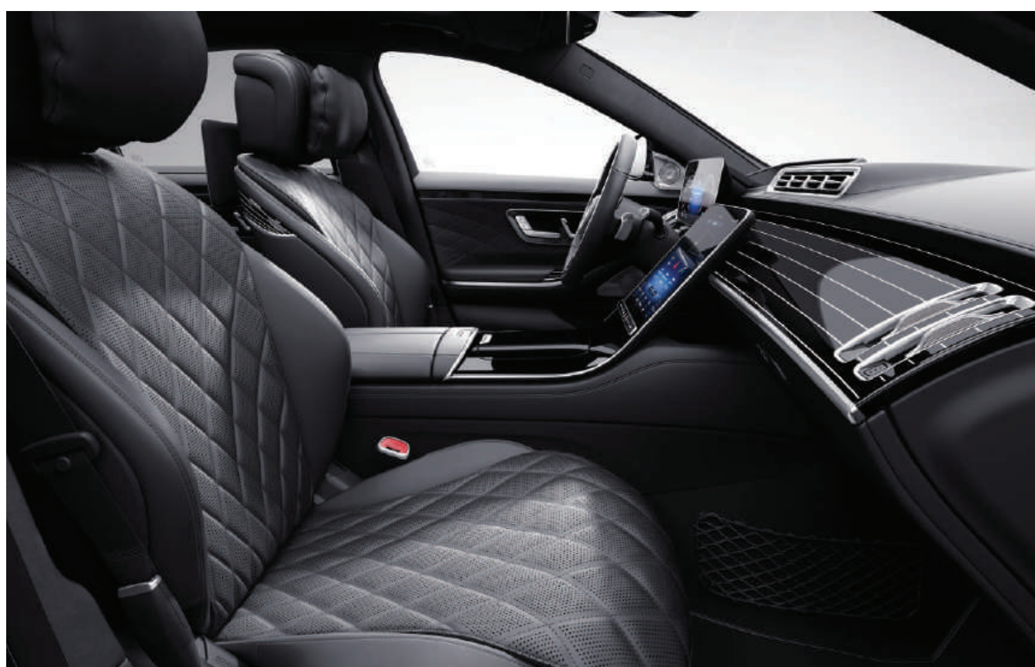
Nappa leather black