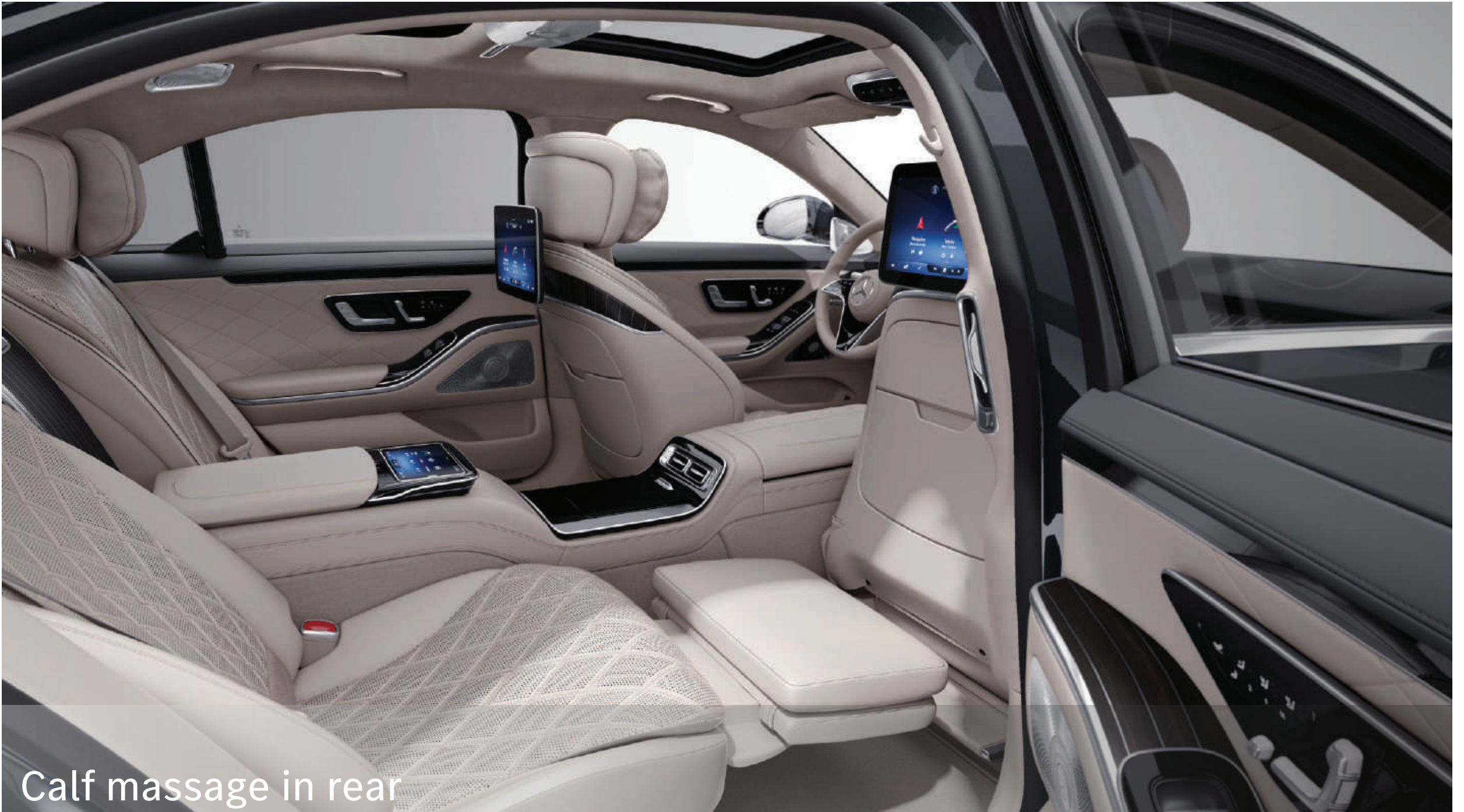
Calf massage in rear