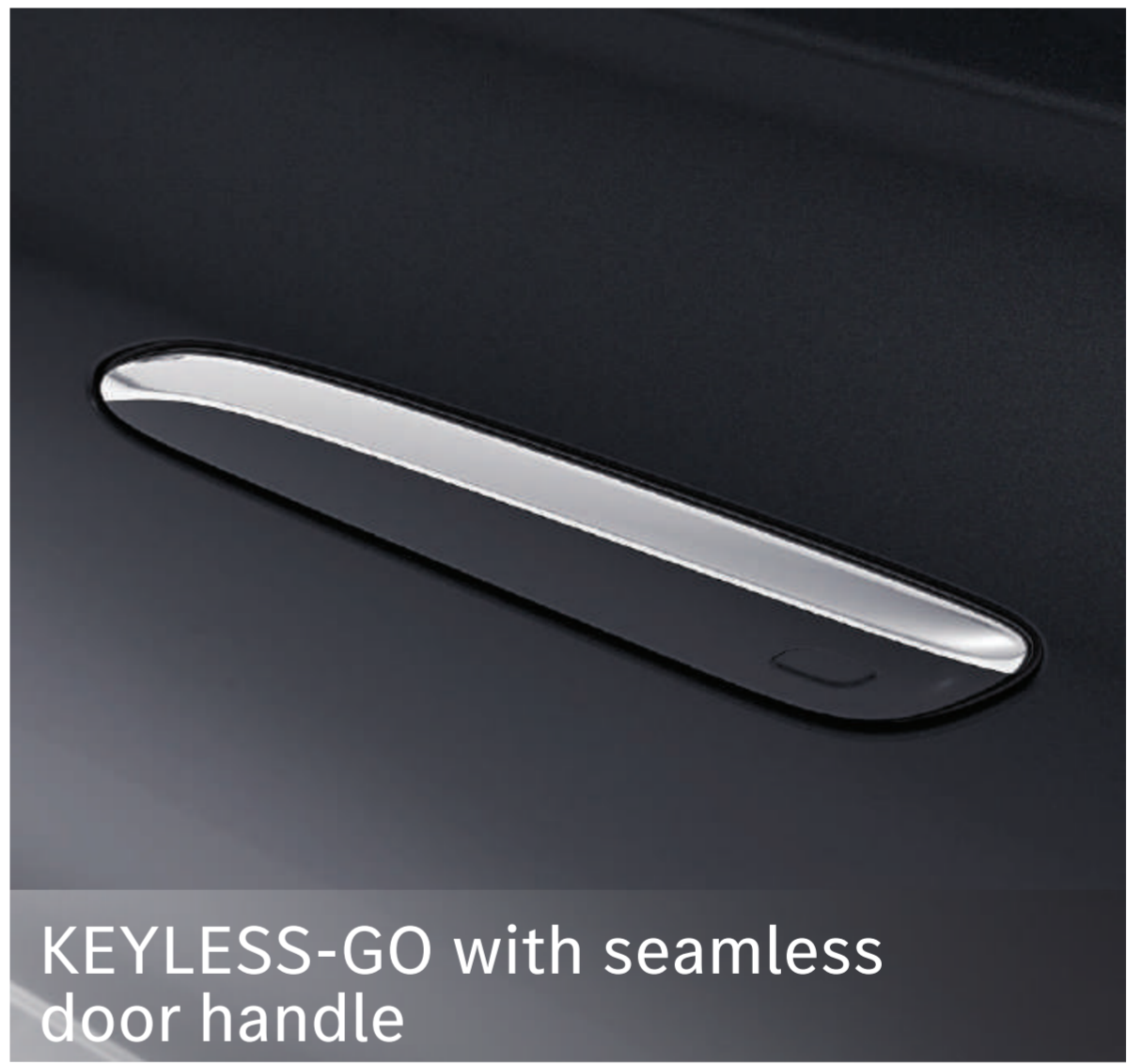
KEYLESS-GO with seamless door handle