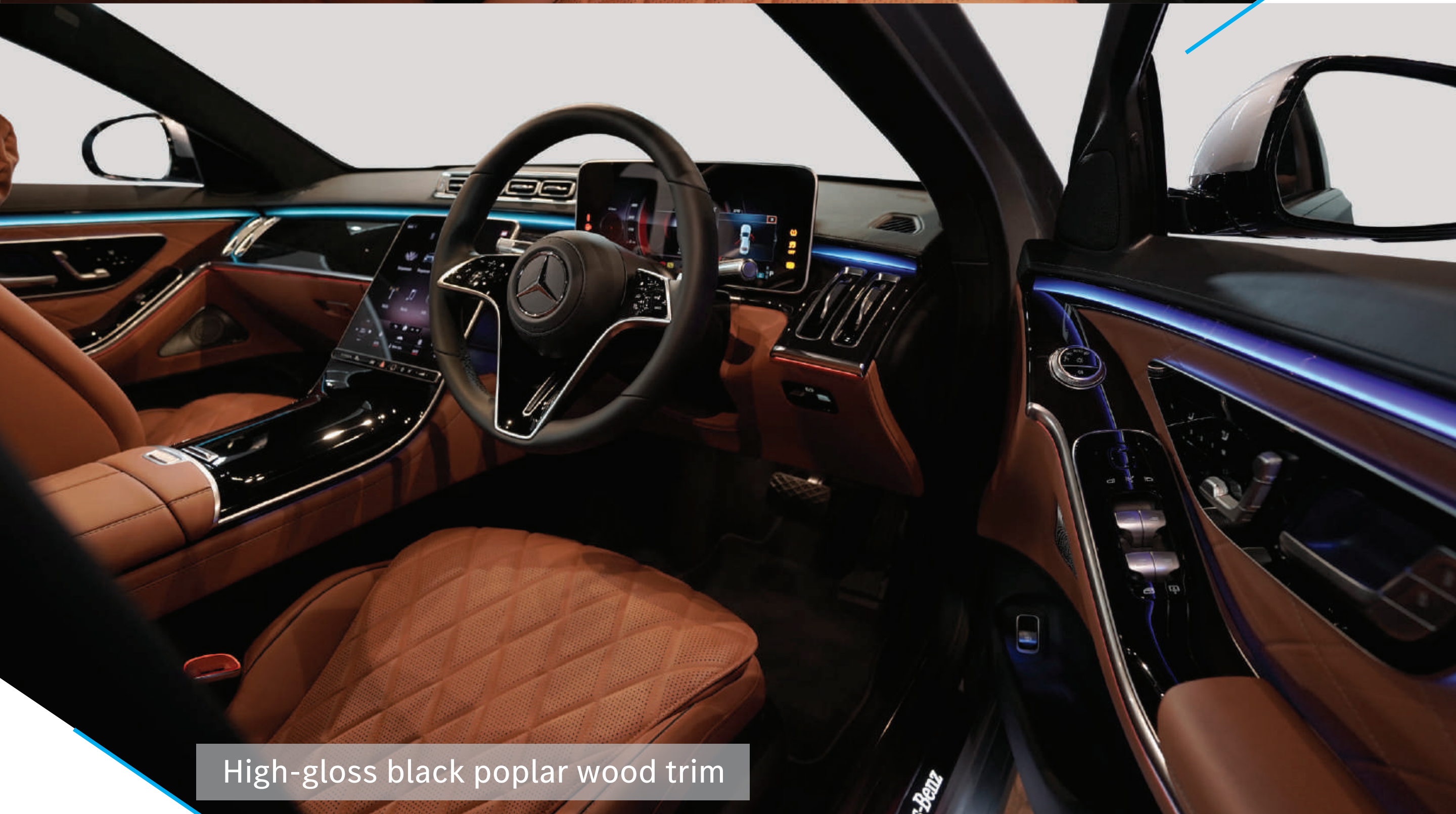
High-gloss black poplar wood trim