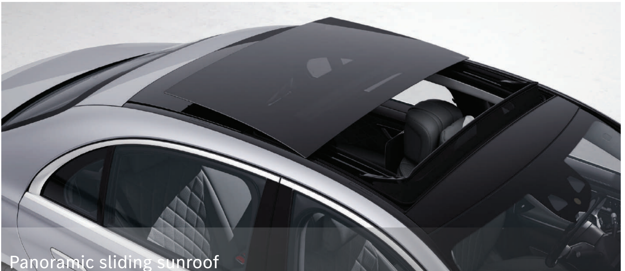
Panoramic sliding sunroof