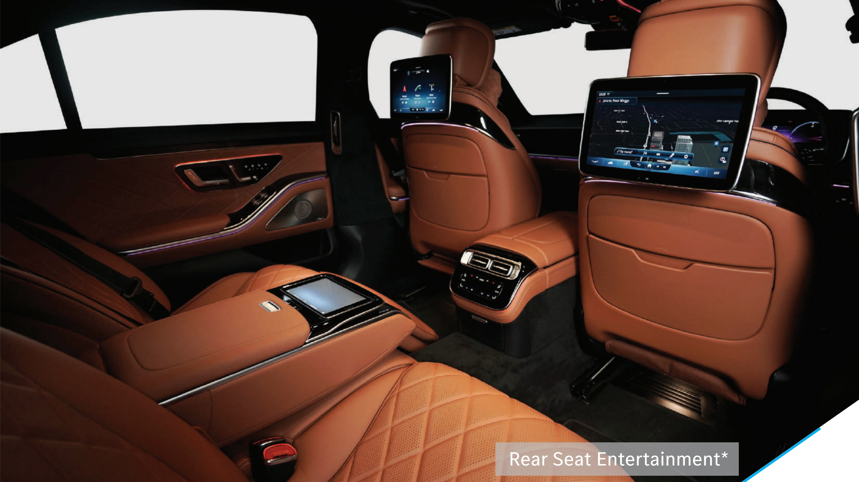
Rear Seat Entertainment*