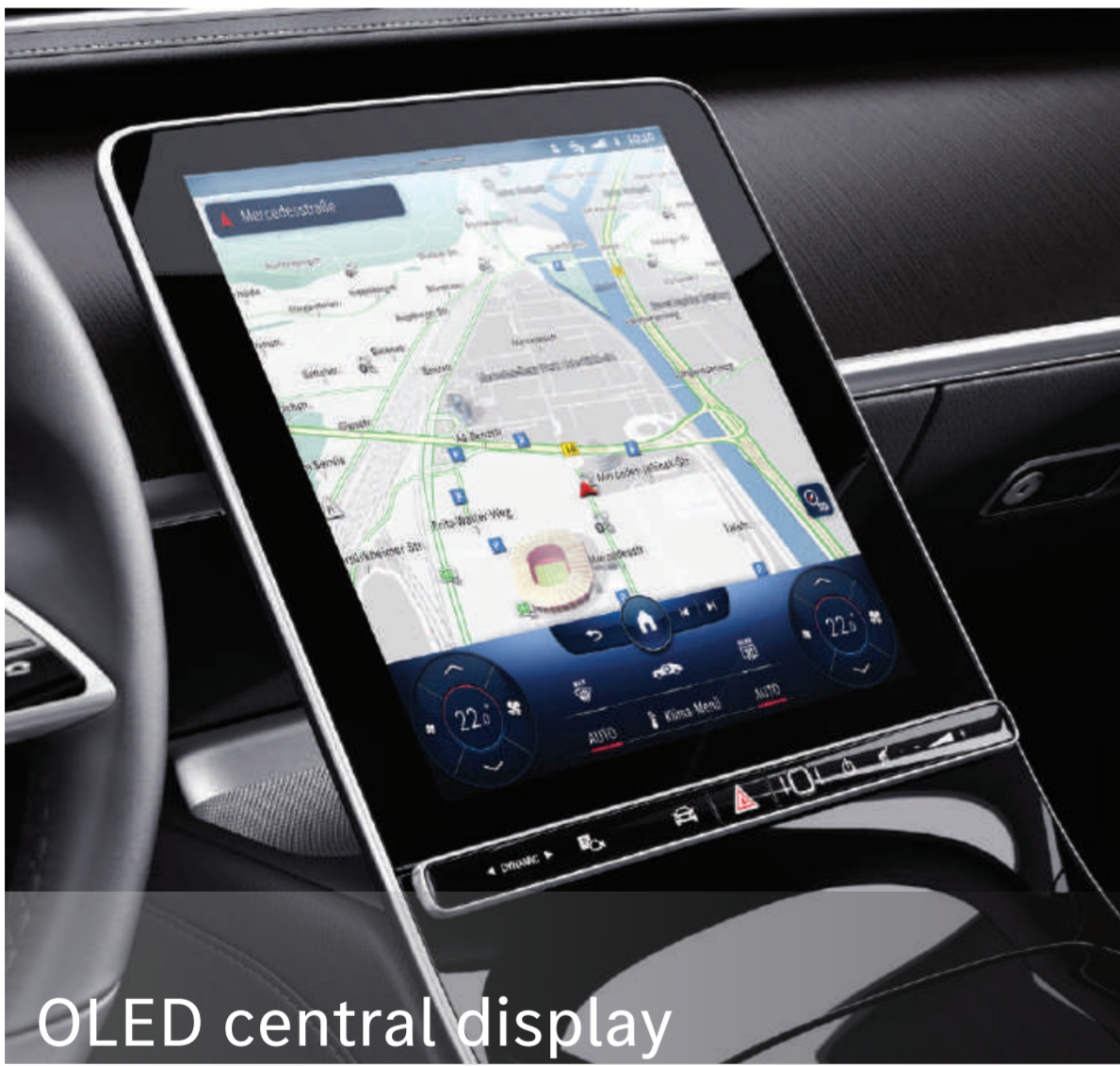
OLED central display